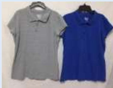
Gray and Royal Blue are not dress code colors