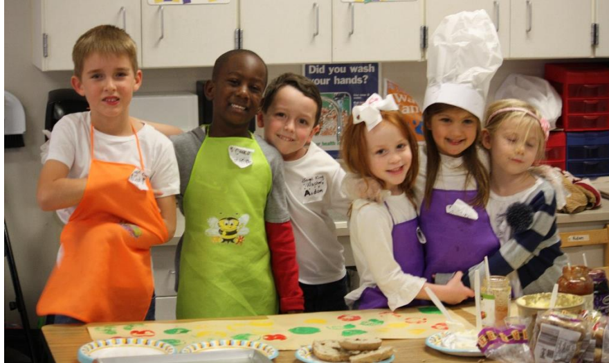
A kindergarten class' "Bagel Café" raised money for a Lego set.