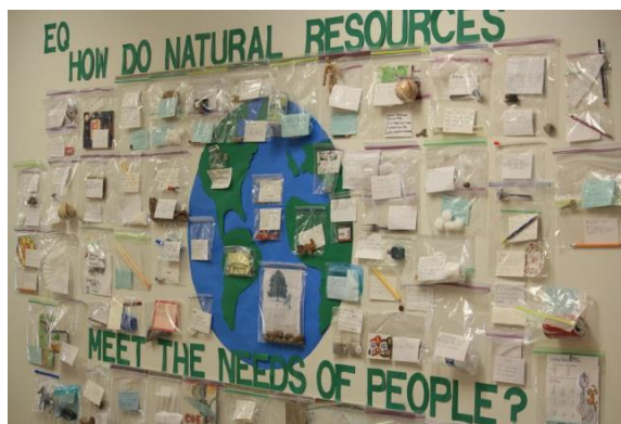
Kindergarten Pajama Project gives to others. First Grade learns about how we use resources.

We believe the following curriculum, instruction, assessment, and environmental factors support effective learning for Sara Collins students.